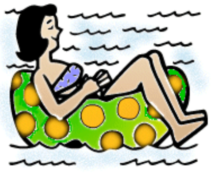
A reminder about swimming pools - please see page 4.

The City of Union's Park Board is gearing up for this season's Spirit of Union program. The Park Board established the Spirit of Union Award in 1997 to encourage exterior enhancements of residential and business properties. The award recognizes those who make exceptional landscaping improvements. Call the City at 836-8624 or nominate online at www.ci.union.oh.us/ spirit.html.