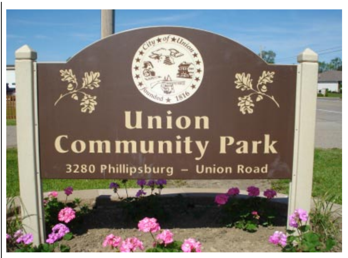
A grant from the Montgomery County Solid Waste District helped the City of Union purchase this new entrance sign and fencing material at Union Community Park. The sign and fencing are made from 100-percent recycled plastics. The City also installed decorative lighting at the Community Park entrance and parking lot.

feet. Also, owners should take measures to prevent a