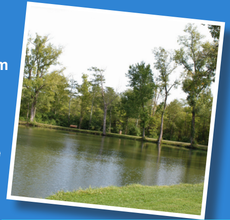
Wellfield Park on River Road in Union is another good example of a stormwater feature.

Making this even worse was roofing and paving which keeps the rain from soaking into the ground. Water that lands on roofs and concrete and asphalt paving runs off and downhill very fast compared to rain that falls on grass and open land.