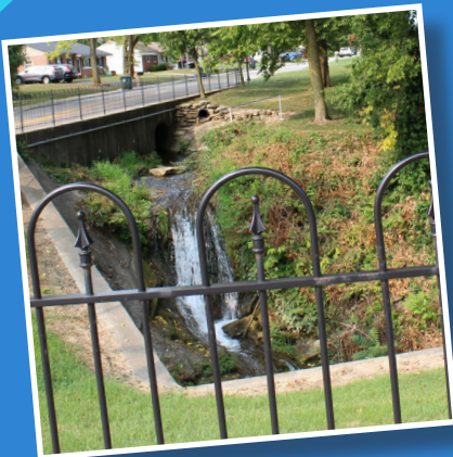
The Falls at Phillipsburg-Union Rd. and Main St. was once a homely storm ditch with maintenance problems.

[As a side note, in many places, sanitary sewage was actually piped into the same ditches and streams as “stormwater.” It was not until the 1960’s that communities began to require the separation of sanitary sewage and stormwater. The author of this article can recall when the resort towns where his family spent their summer vacations began to build their first sanitary sewage plant to clean up the sewage water before it drained into the bucolic lake in their midst!]