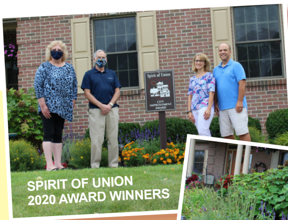
SPIRIT OF UNION 2020 AWARD WINNERS

NOVEMBER 3, 2020 IS ELECTION DAY! FOR VOTING QUESTIONS PLEASE CALL THE BOARD OF ELECTIONS AT 937-225-5656 OR VISIT AT WWW.MCBOE.ORG